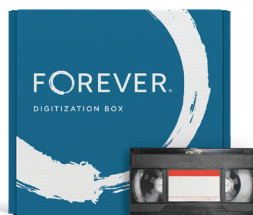
2 Item - Small (13" x 13" x 3")

Each FOREVER® Digitization Box includes a set number of items that can be sent in to be digitized. If you have more, no problem! Add all your items and we will invoice you for the extra.