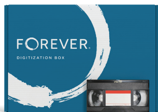
20 Item - Large (19" x 14" x 8")