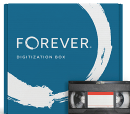
10 Item - Medium (14" x 14" x 6")